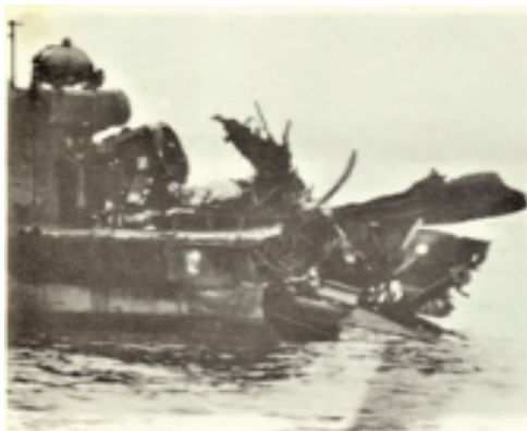
JAVELIN SUFFERED EXTENSIVE DAMAGE IN ACTION

Despite their offer of assistance, the navy instructed the Duke of York to return to station as naval vessels were on hand to deal with the situation. The Javelin was forced out of the battle and was, eventually, towed back to harbour. She was out of action for almost a year for repair. She went on to participate in 'Operation Ironclad', the assault on Madagascar in May 1942 and in the failed 'Operation Vigorous' attempt to deliver a convoy to Malta. In June 1949, she was taken to Troon, Scotland and broken up by shipbreakers in the yards there.