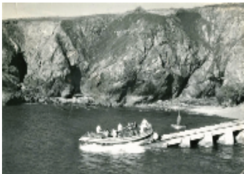
THEN RNLB DUKE OF YORK

This demonstrates 'Then and Now' incidents which were eighty-two years apart and it was certainly two different types of 'busy' for the two Lizard Lifeboats involved. However, one thing is certain and that is that both eras required brave, committed, well-trained and experienced crews to fulfil their duties.