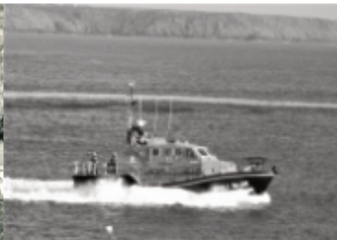
NOW RNLB ROSE