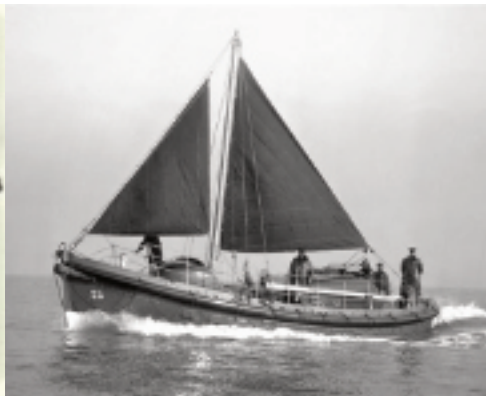
RNLB DUKE OF YORK c 1931

This demonstrates 'Then and Now' incidents which were eighty-two years apart and it was certainly two different types of 'busy' for the two Lizard Lifeboats involved. However, one thing is certain and that is that both eras required brave, committed, well-trained and experienced crews to fulfil their duties.