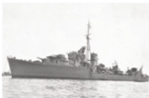
'J-Class' DESTROYER 'HMS JAVELIN'

Eighty-two years ago this month, in November 1940, it was also a busy and dangerous period for the crews of RNLB DUKE OF YORK, the Lizard Lifeboat at that time. On the 24 th November 1940, the lifeboat was launched to assist two German airmen shot down three miles off shore. In the event, they were brought ashore with one airman wounded and the other, unfortunately, dead. Next day, the lifeboat was out again searching for possible survivors of a naval and air battle which took place in the area of Wolf Rock, 8 nautical miles south west of Lands End. After a long and thorough search of the area the lifeboat was stood down, after nothing had been found. Four days later, on 29 th November 1940, the Duke of York was launched again, this time to assist the destroyer HMS Javelin which was on fire 15 miles off the coast and the shout actually took the boat to within sight of the on-going naval battle in which the Javelin was damaged.