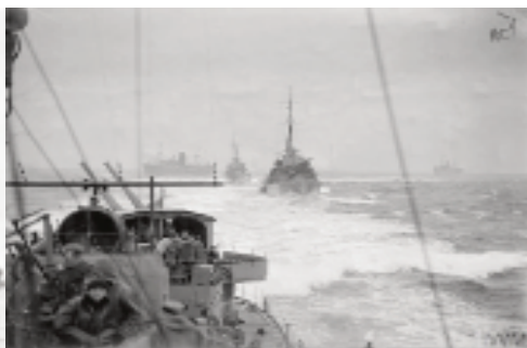
'HMS JAVELIN' ON CONVOY DUTY

HMS Javelin was built by the John Brown Company in Clydebank, Scotland and launched on 21 st December 1938. On the 29 th November 1940, she was part of the '5 TH Destroyer Flotilla' which consisted of HMS Jupiter, Javelin, Jackal, Jersey and Kashmir. The Flotilla was under the command of Captain Lord Louis Mountbatten and was operating off Plymouth. The flotilla engaged the German destroyers Hans Lody, Richard Beitzen and Karl Galster. In a fierce exchange, the Javelin was badly damaged by gunfire and torpedoes fired by the German destroyers, losing both her bow and her stern.