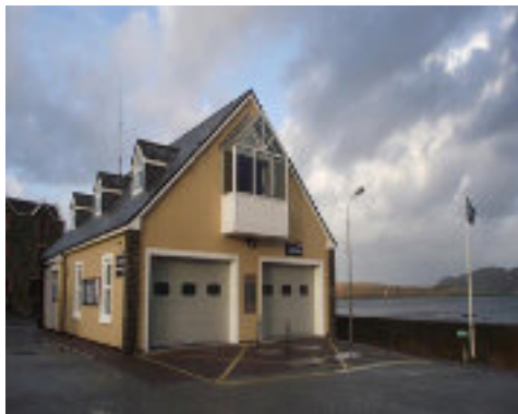
VALENTIA, CO. KERRY