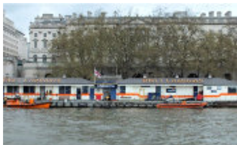
TOWER STATION, LONDON