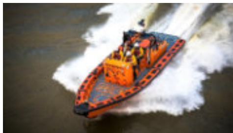
'E' CLASS, HURLEY BURLEY IN ACTION

Unfortunately, our own station visitor centre still remains closed to the public until further notice through the continued effects of Covid and essential maintenance work to the station lift. Any change in circumstances will be notified immediately.